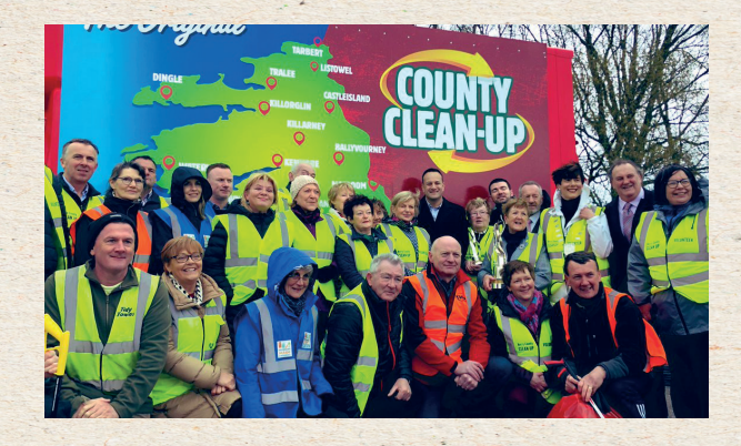
Together let's Care for our Common Home