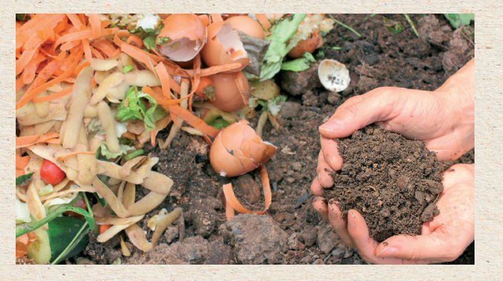
'Many things have to change course, but it is we human beings above all who need to change.' (LS 202)

In Genesis 2:15 we were called to till and keep the garden of Eden.