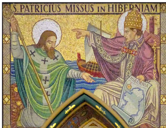
Wall mosaic in St Mary's Cathedral, Kilkenny.