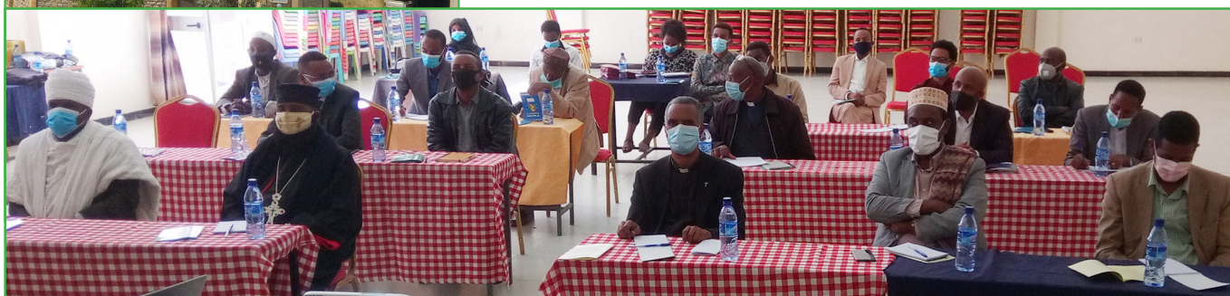
Below: Interreligious Council, Mekelle 2020