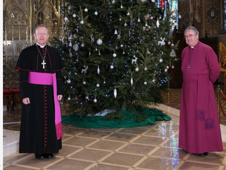
Archbishop Eamon Martin and Archbishop John McDowell

In their joint message for Christmas 2021 the Catholic and Church of Ireland Archbishops of Armagh are reflecting on the "little ones" mentioned in the Gospels. They said, "At this time of the year, perhaps, it is the very lavishness of Christmas that gives us a heightened consciousness of (and a bad conscience about) the "little ones" mentioned so often in the Gospels: the homeless, the poor, the rejected, and all those who long to see the world turned upside down again, when "the earth shall be full of the knowledge of the Lord, as the waters fill the sea".